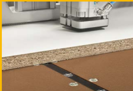
The center fence can be lowered manually to accommodate large workpieces