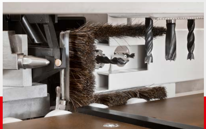
Drilling and dowel insertion station