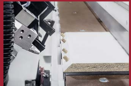
Tiltable drilling and dowel insertion unit (0° and 45°)