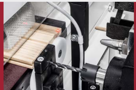
Automatic detection of stock width