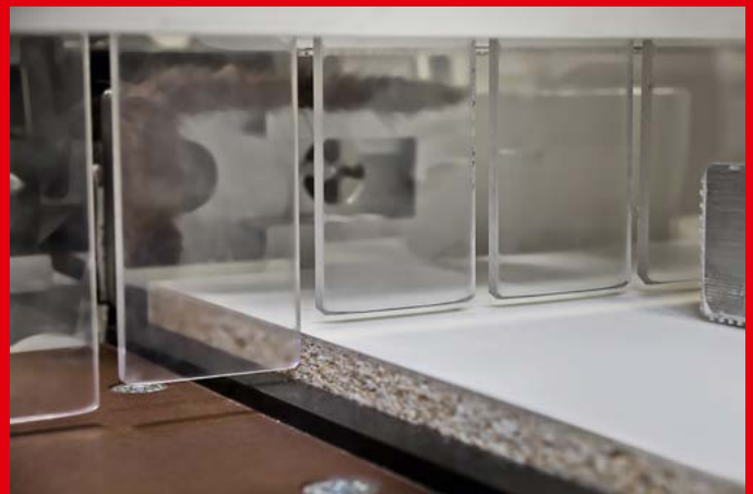
A safety curtain with transparent lamellas and a memory function protects against inadvertent entry into the danger zone