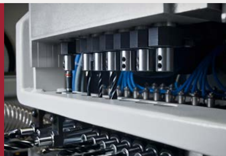
Customized drilling station with seven vertical and ten horizontal drilling spindles