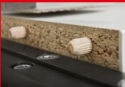
Lowered side fence for doweled parts