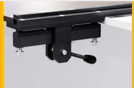
Adjustable side and center fences can be positioned manually to three different heights