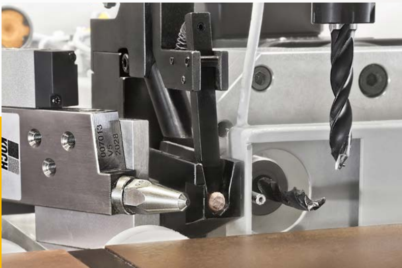
Drilling and dowel insertion station