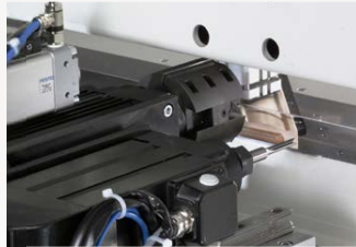
Horizontal routing is used to make mortise and tenon joints for cabinet door components