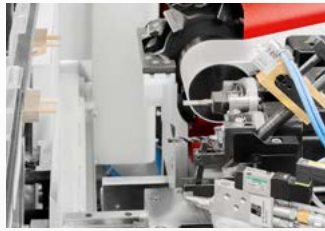
Routing for French Cut frame joints